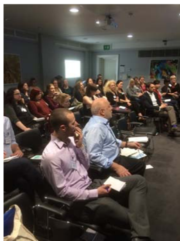
Attendees listen to a talk during the meeting.

GCP training: Getting GCP training for staff is a challenge and prevents sites from including cath lab staff in recruitment. Portsmouth have had success involving senior members of staff to ensure time is available for junior members to complete GCP training. Other sites agreed that this has to come from the top down.